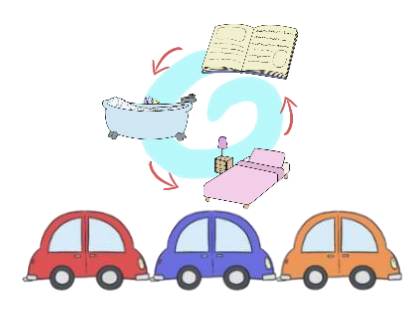
Prefers familiar routines. Displays repetitive behaviours or movements. Arranges objects in patterns or lines.