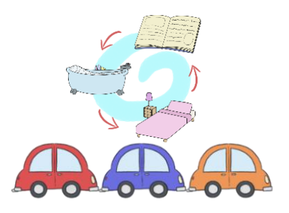
Prefers familiar routines. Displays repetitive behaviours or movements. Arranges objects in patterns or lines.